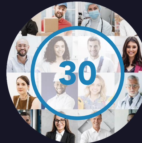
MILLIONS OF HISPANICS