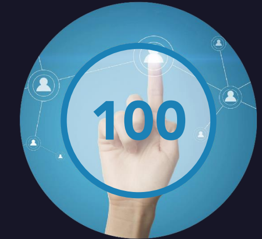
BILLION IMPRESSIONS PER MONTH